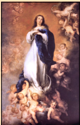
“The Immaculate Conception”

Genesis 3:15 - “I will put enmity between thee and the woman... She shall crush thy head and thou shall lie in wait for her heel.”