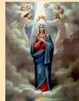
The Coronation of Mary

In the name of the Father and the Son and the Holy Spirit. AMEN